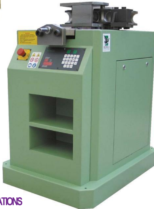
MODEL ETM89 STOCK CODE 21340 415V

The Memoli range of bending machines manufactured in Italy, have been designed for high quality tube bending. Formers for bending metric tubes and 'gas' pipes are readily available together with guide rollers and counterformers. Three models are available with tube bending capacities of up to 60mm, 76mm and 88.9mm, all with programmers for high efficiency production bending.