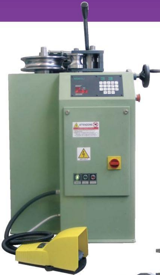
MODEL ETM60 STOCK CODE 21330 415V